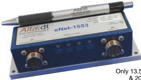
Only 13.5 x 3.7 x 4 cm & 200 grams Small, Rugged Appliance